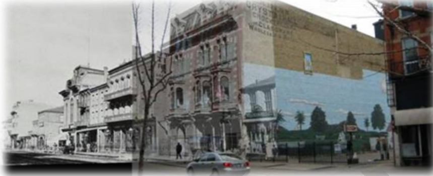
Image: Overlaid London Streetscape