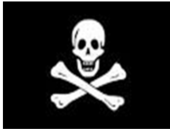
Image: Skull & Crossbones

Office Hours: 12pm – 2pm Department of History, Office: Lawson Hall 1207 Email: mdove2@uwo.ca