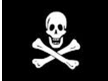
Image: Skull & Crossbones

Office Hours: Mondays, 1pm – 3pm Department of History, Office: Lawson Hall 1207 Email: mdove2@uwo.ca